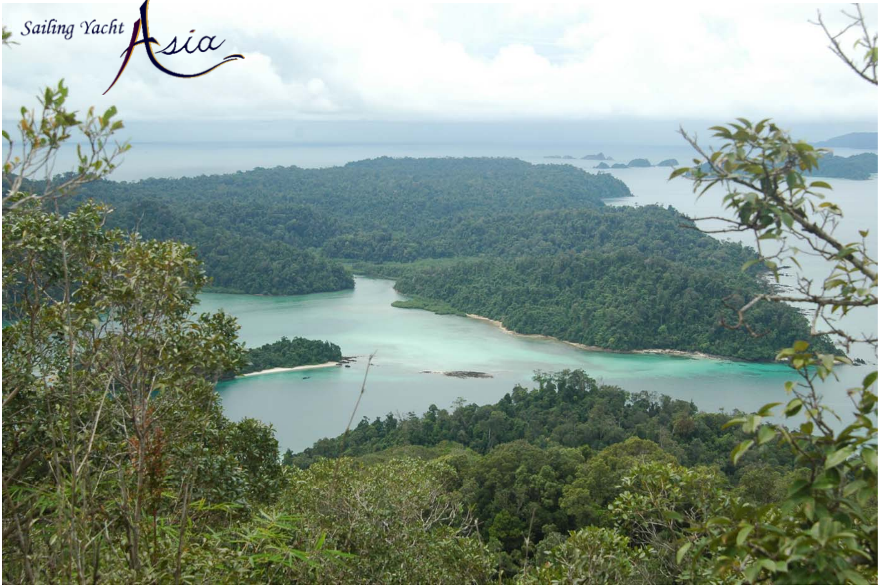
Mergui Archipelago of Myanmar