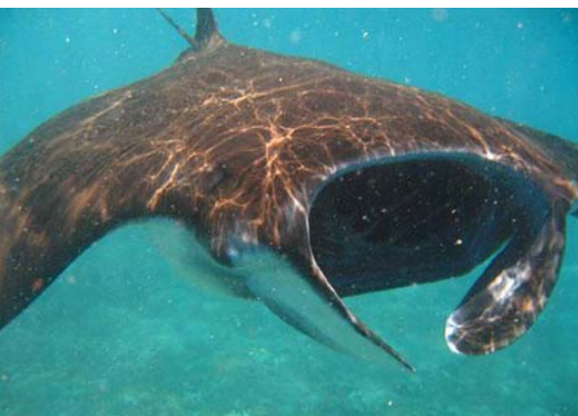
Graceful Manta Rays